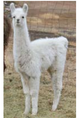
Stage Stop Candle In The Wind