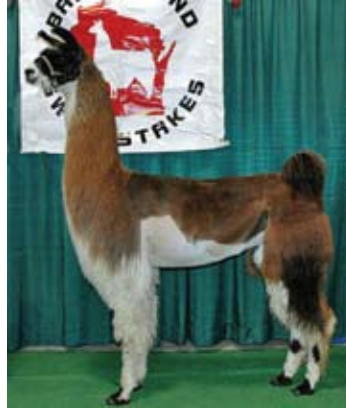
Bad Moon Rising