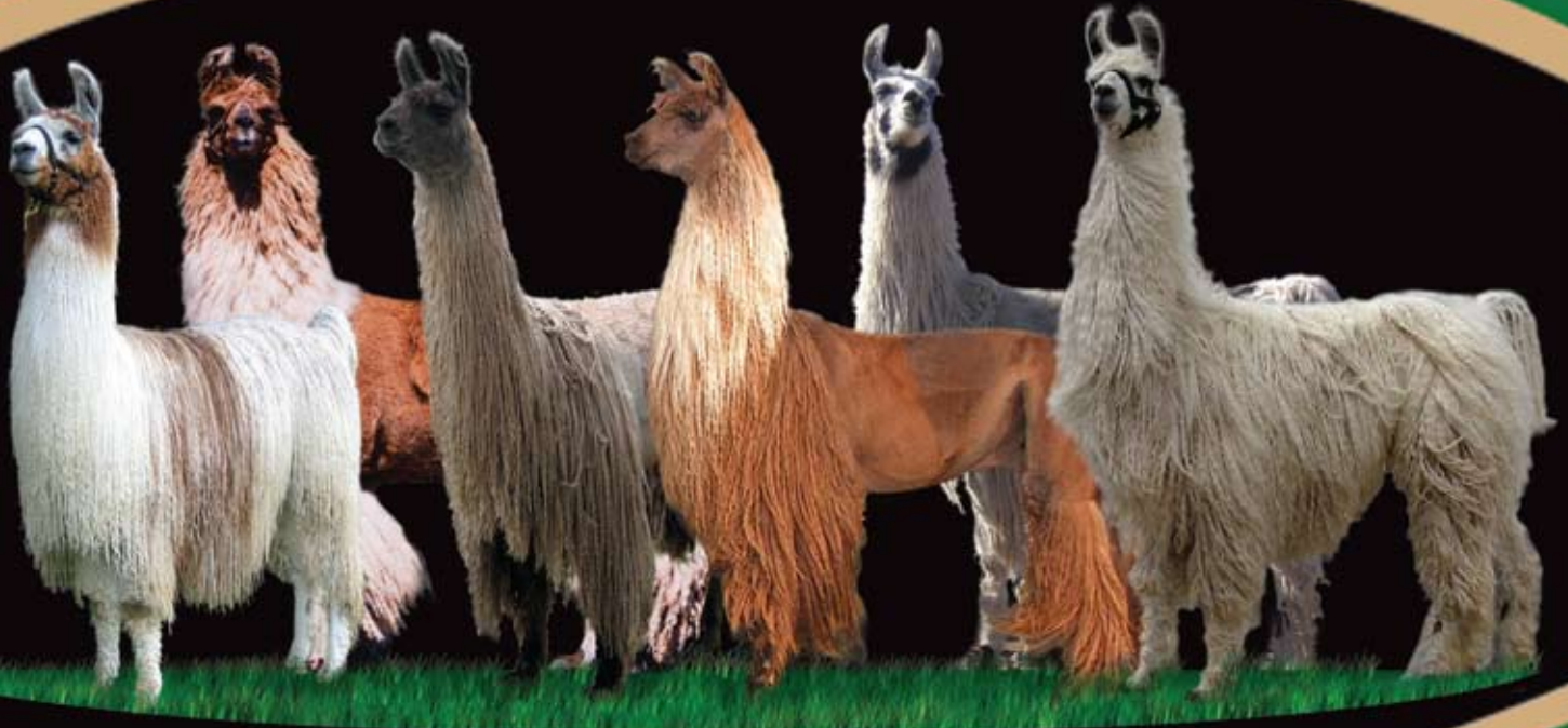
SIR E SUR-REAL