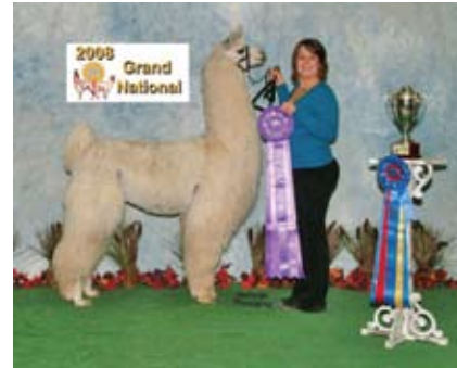
Argentine Poltergeist (ET) 2008 Grand National Reserve Champion Heavy Wool Male

“Did you see that llama? Oh my, what a beautiful animal! I have not ever seen such an exotic llama!” Yes, there is excitement in the air! We just got back from the Celebration Sale in Oklahoma City and what a great experience we had. We were fortunate to have some magnificent Argentine llamas represented there in the shows. We had taken two full Argentines to show in the World Futurity and had nothing but wonderful comments on both. There were also several more awesome full Argentines there, plus some really great part Argentines. And there was excitement in the voices of those talking to us about them.